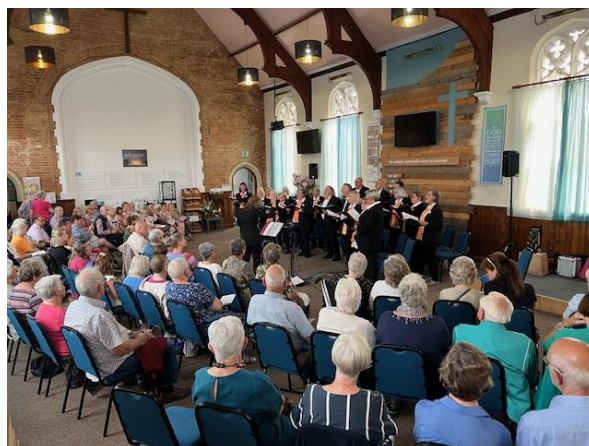
Visit from St, Mary's Singers